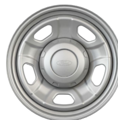
18" Argent Painted Steel w/painted hub cover/center ornament (Std. on XL F-350 SRW) – 64F