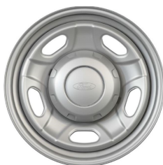
17" Argent Painted Steel w/painted hub cover/center ornament (Opt. on XL and XLT) – 64A