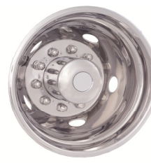
17" or 19.5" Stainless Steel Wheel Covers (Front & Rear) (Opt. on XL and XLT) – 945