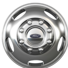
17" Forged Polished Aluminum w/bright hub cover/center ornament (Std. on Lariat F-350; Opt. on XL and XLT F- 350) – 64J