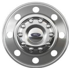
19.5" Forged Polished Aluminum w/bright hub cover/center ornament (Std. on Lariat F-450 and F-550; Opt. on XLT F-450 and F-550) – 64D